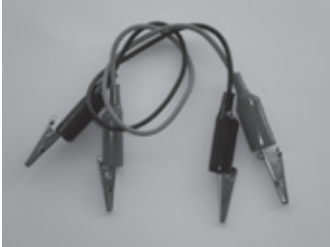
Leads with alligator clips