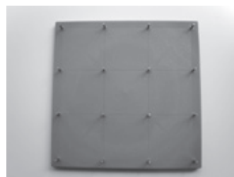
Base board with aluminium pegs