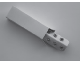
Lamp bulb 2.5v