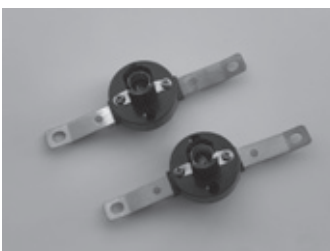
Lamp holder with connector