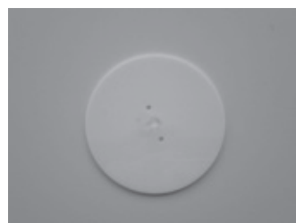
Electrode support disc