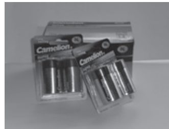
Battery D Pkt 12