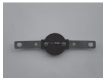
Resistor with connector (blue)