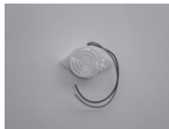
Buzzer low voltage