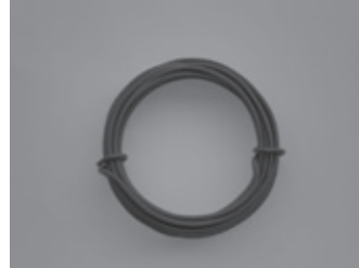
PVC coated copper wire