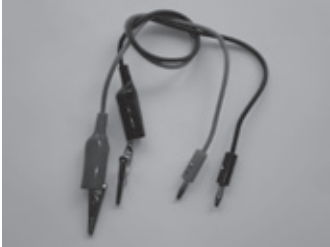
Leads with plug and alligator clip