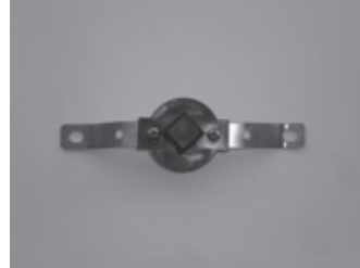
Switch with connector