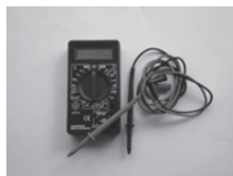
Multimeter 19 range digital with continuity function. Basic Unit