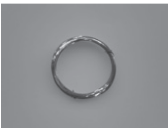
Bare copper wire