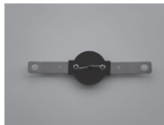
Diode with connector (black)