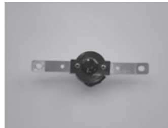
Rheostat with connector