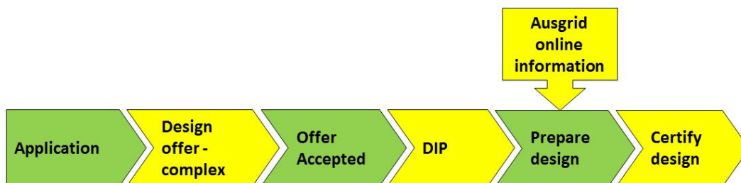
Complex design flowchart

* Ausgrid Major Connections Projects (typically sub-transmission) are outside the scope of this document including the above design information categories and are subject to Ausgrid's Major Connections process requirements.