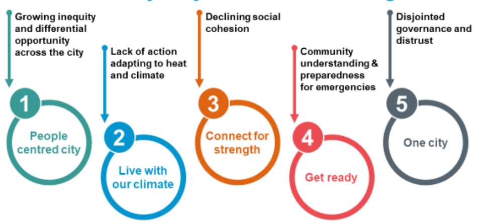
Figure 1: Greater Sydney resilience challenges and strategy directions from the Resilient Sydney strategy (2018)