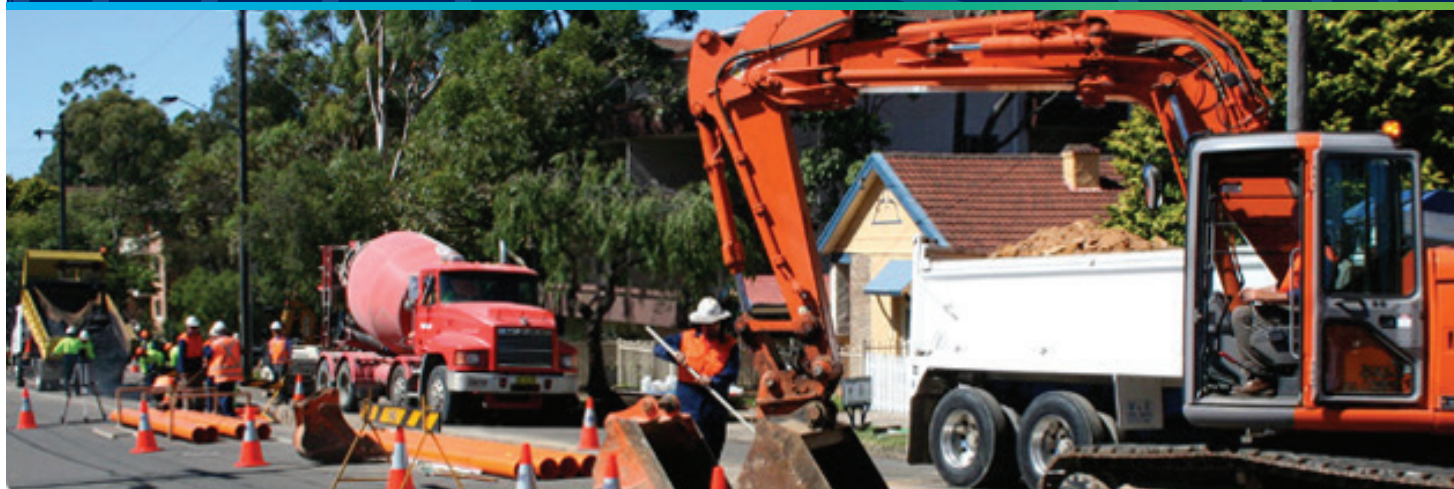
A similar cable project in progress