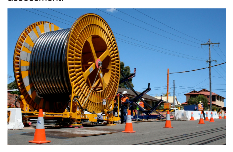
Cable installation on a similar project

Ausgrid will keep the community informed as the project progresses via updates like this one and notification letters. The latest project information will also be available on the project's web page (see below). There will also be an opportunity to make a submission on the environmental assessment.