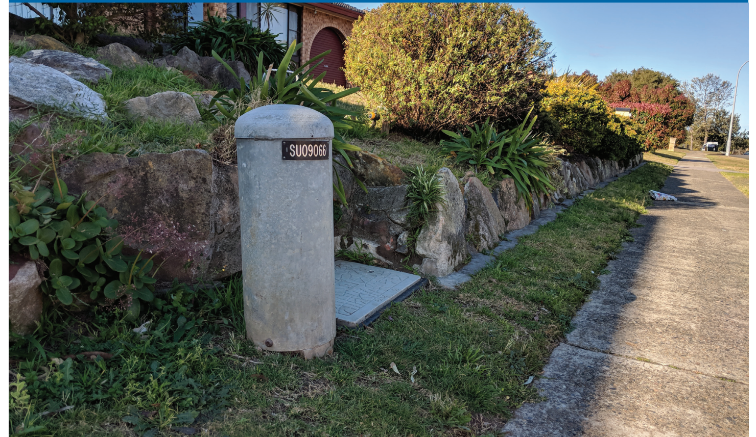
Typical street in Illawong