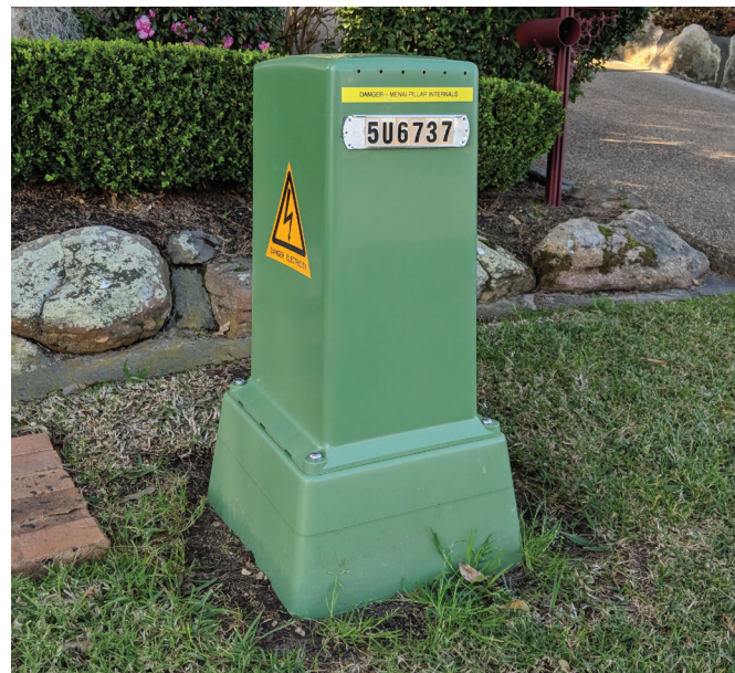
Typical current standard pillar to be installed