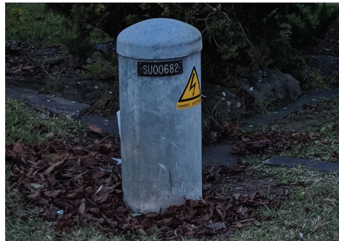
Typical pillar to be replaced