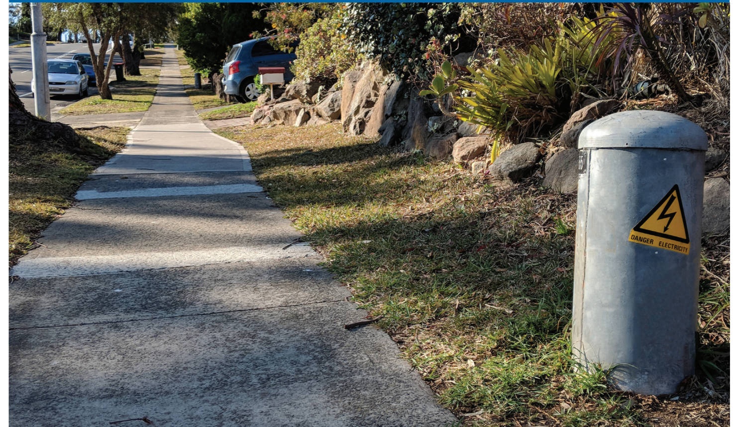
Typical street in Menai