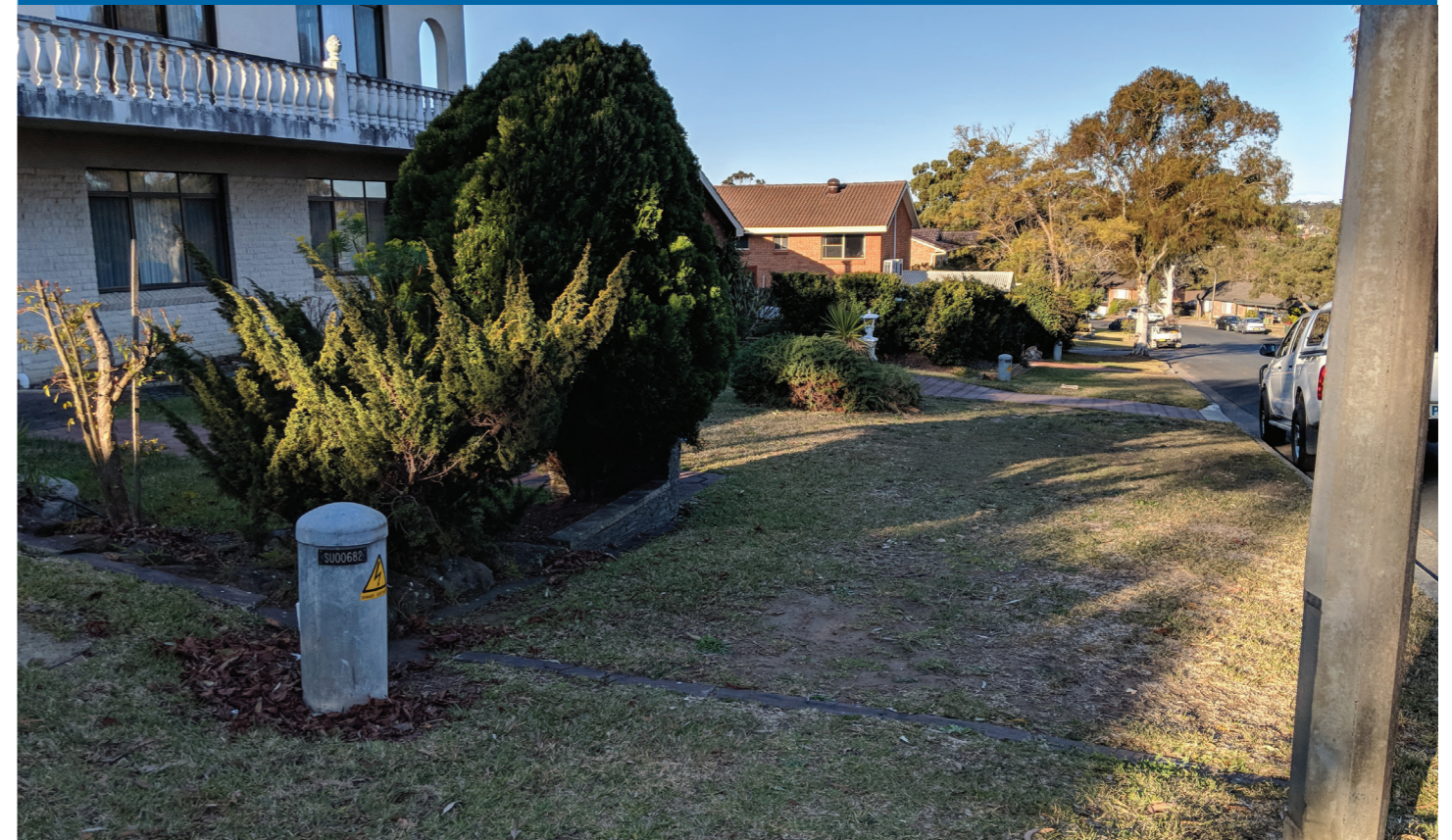
Typical street in Bangor